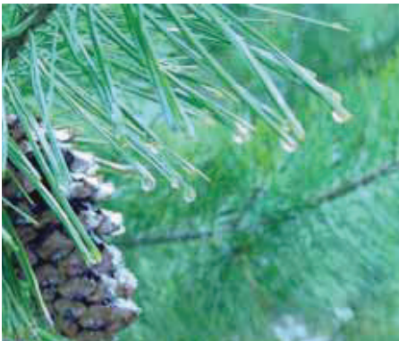
In Washington's forests, the needles of evergreen trees hold a lot of rain—as much as 40 percent of a low intensity rainfall.

Watch how rainwater flows downhill and collects in low places. See how quickly it starts running down a downspout or into a gutter. Feel how pavement stays hard but soil gets soft. Pay attention to what the water sweeps along in the gutter and where there's an oily sheen on a puddle. Notice what happens to streams and rivers. Notice how runoff seems to be everywhere in the city and is harder to find in the forest.