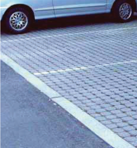
Permeable pavement like this provides a hard, drivable surface, but it also lets some stormwater soak back into the ground.