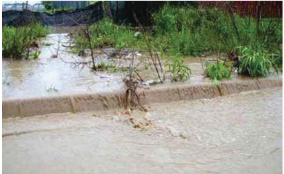
Water flowing through a watershed picks up things in its path and carries them along, including pollution and debris.

The way we use and develop the land changes not only where stormwater goes and how fast it gets there, but also what it meets along the way — parking lots, roads, roofs, farms, ranches, ball fields and more. Whatever stormwater runoff picks up from these places, it carries into Washington's waters.